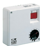
C 2.5 (COMANDO EL. 2.5 A)