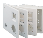
KIT SCB5 (TRASF.5 V.)