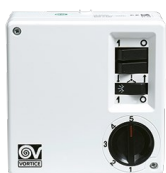
SCNR5 UNIF.X NK SOFFITTO