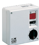
SCNRL5 UNIF. X NK SOFFITTO