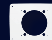
Cover plate 190 x 240 mm