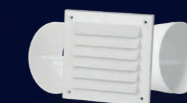
Mounting kit YVG for wall Ø 100 and 125 mm

There are several accessories for Fresh Intellivent® ICE that make installation as simple as possible. Here are some examples. For more information www.fresh.eu